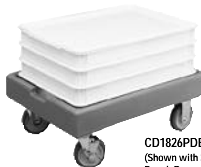
CD1826PDB (Shown with 3 each stacked Pizza Dough Boxes Product #DB18263CW)