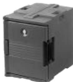
For Camcarrier (UPC400)