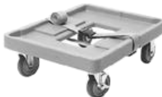
CD400 (Shown with Optional Strap)