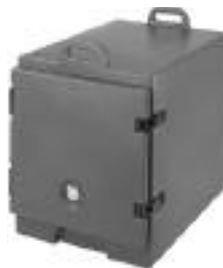
For Camcarrier (300MPC)